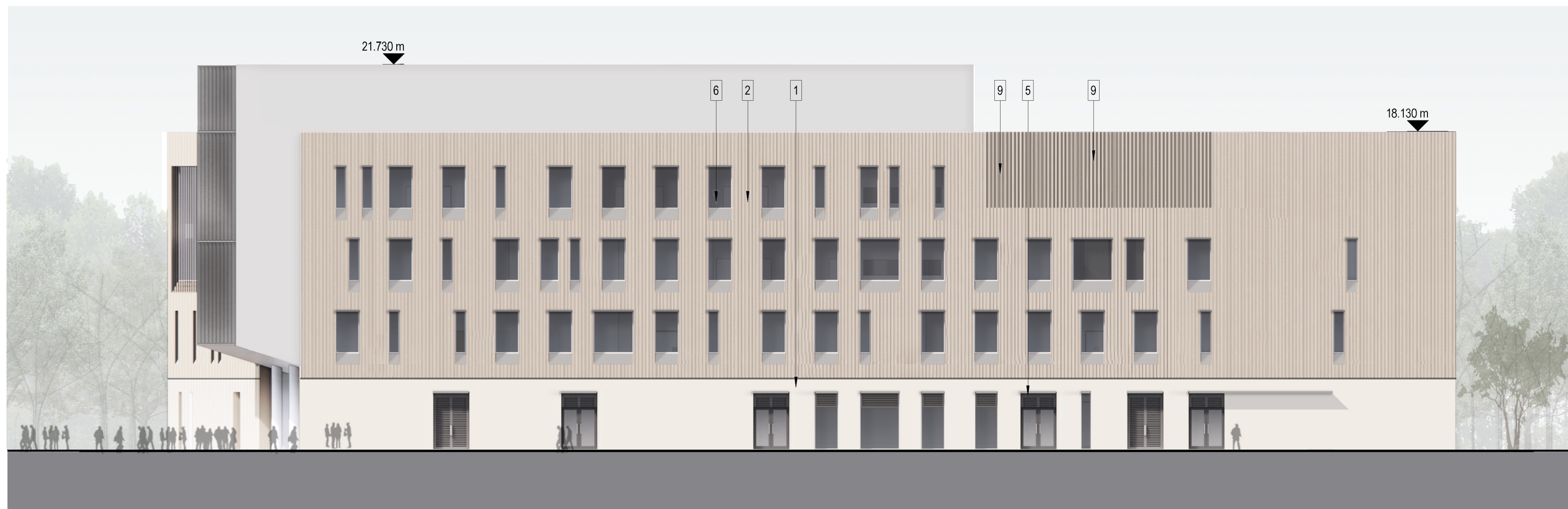
2 Planning GA South Elevation 1 : 200